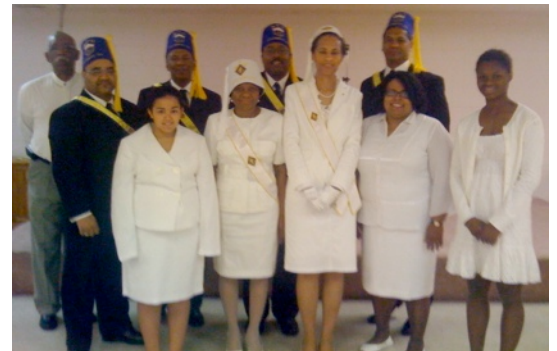
May 15, 2011 Low Sunday Turnout