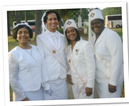
Cincinnati, Columbus, and Indianapolis Ladies turnout at IAACEC

Members of our Court attended the Interregional African American Catholic Evangelization Conference ( IAACEC ) in Jackson, MS on June 2-5. During the conference, we participated in the KPC turnout at Christ the King Church (Jackson) where we met Supreme Knight DeKarlos Blackmon.