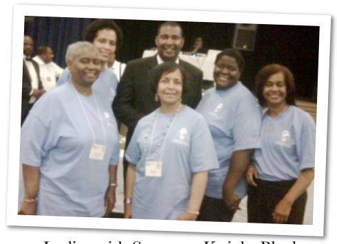
Ladies with Supreme Knight Blackmon

Members of our Court attended the Interregional African American Catholic Evangelization Conference ( IAACEC ) in Jackson, MS on June 2-5. During the conference, we participated in the KPC turnout at Christ the King Church (Jackson) where we met Supreme Knight DeKarlos Blackmon.